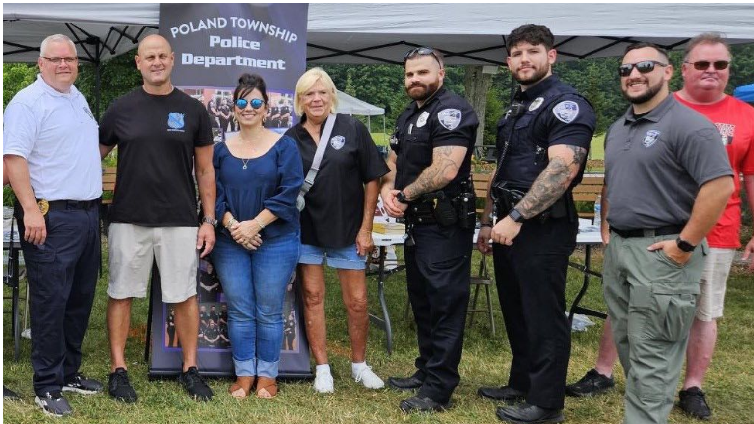
Our Trustees and Officers at the Poland Safety Forces Appreciation Picnic at the Poland Township