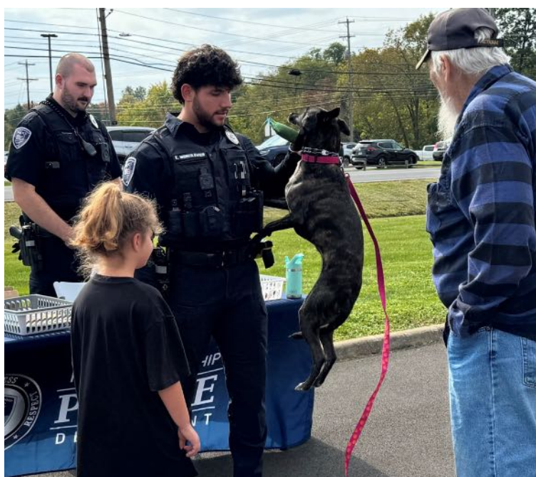
Just in case you were wondering how Pogo got her name...