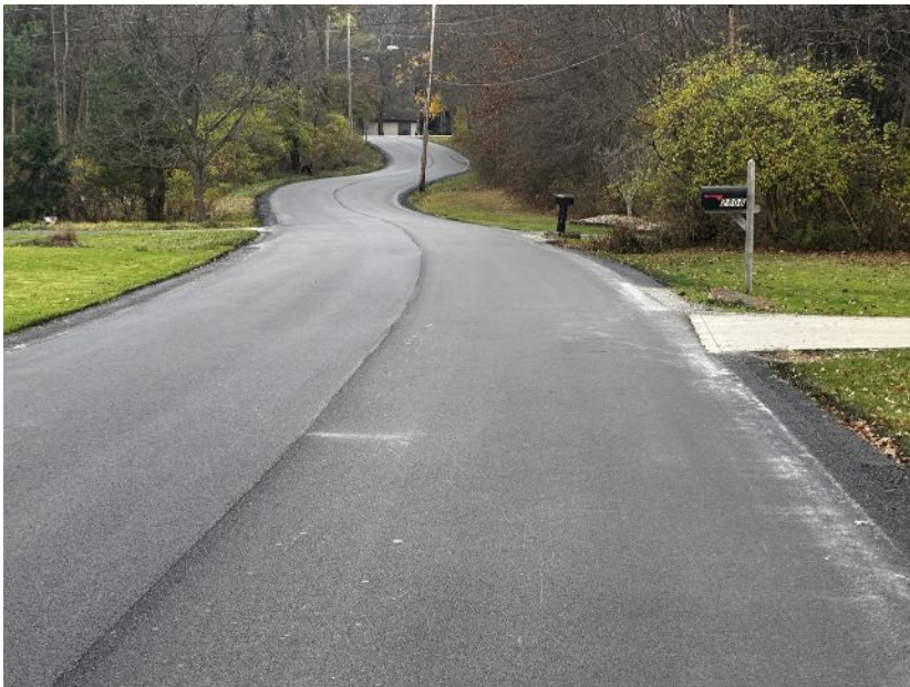
Denver Drive road resurfacing and shoulder enhance