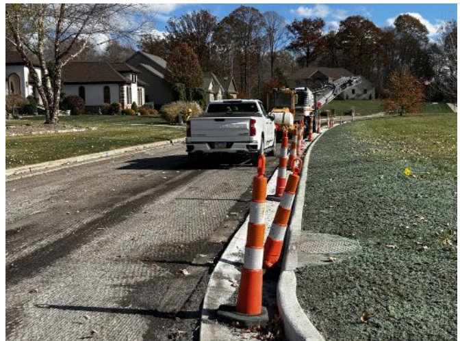
This is Polo Blvd curb replacement project