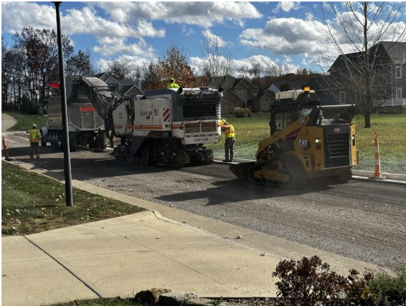
Polo Blvd. under construction