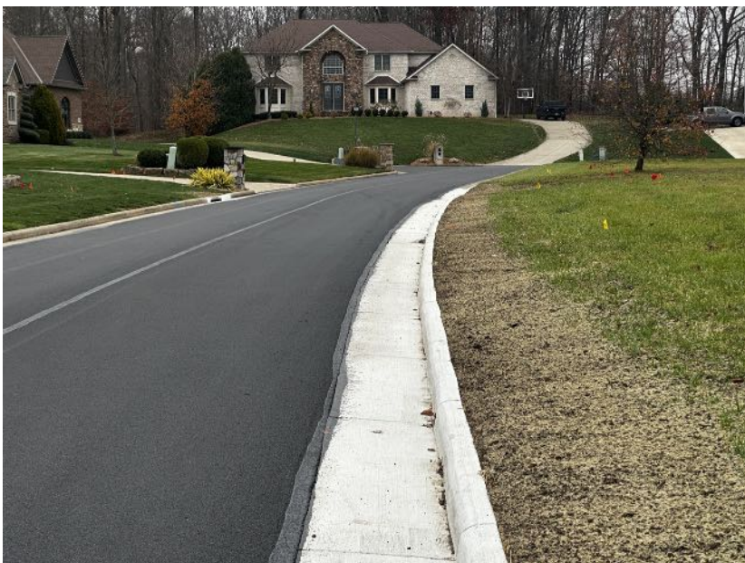
Polo Blvd curb replacement and road resurfacing project completed