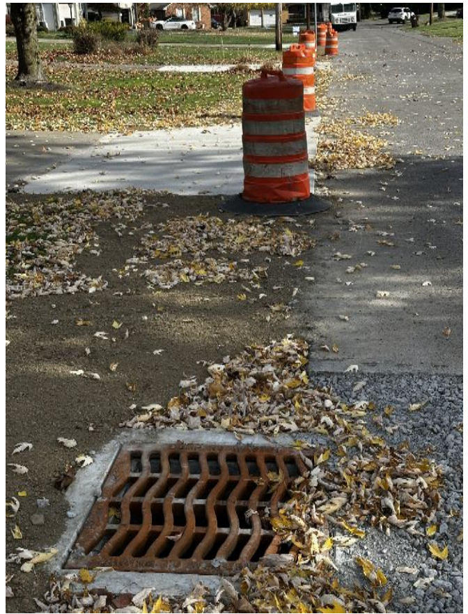
Venloe Drive Phase 2 Stormwater Management Project